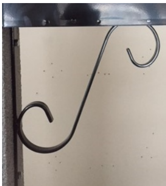
Black Iron 14"x14"