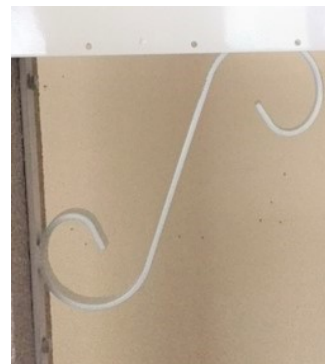
White Iron 14"x14"