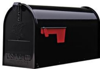
Black Metal 18"x8"x6"