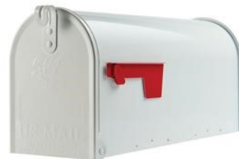
White Metal 18"x8"X6"

GraniteLite™ Phone: 800-442-5535 www.granite-lite.com